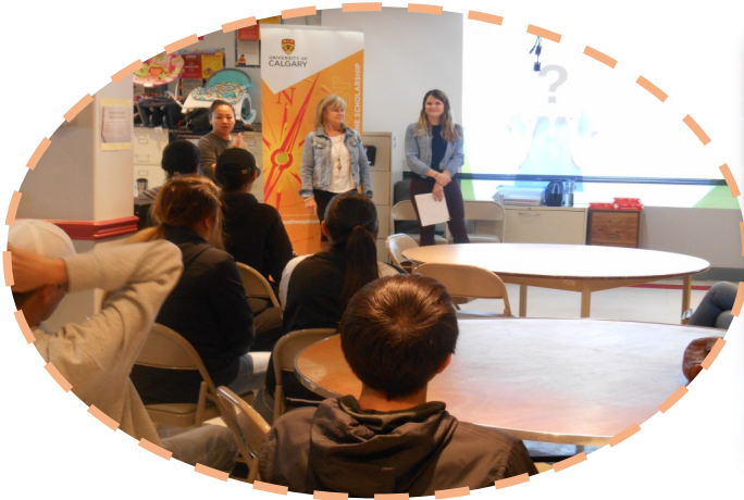
Med School Presentation