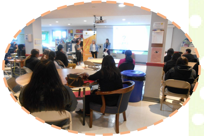
Med School Presentation